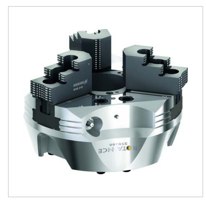
Fig. 5: Result of the optimization process - ROTA NCE

a 20 percent increase of the maximum bearable clamping force. In combination with the reduced jaw centrifugal mass, a possible speed increase of 10 percent could be achieved. By reducing the time for testing combined with a stress calculation according to the FKM guideline and depending on the sizes, a cost reduction of approx. 30% could be reached in the development. As a result, the SCHUNK ROTA NCE lathe chuck provides the user with ideal conditions for high process dynamics and productivity while using a minimum of energy. Particularly in large-scale production, the energy- and cycle-time efficiency of the chuck leads to significant savings and fulfills the DIN EN ISO 50001 energy management certification.