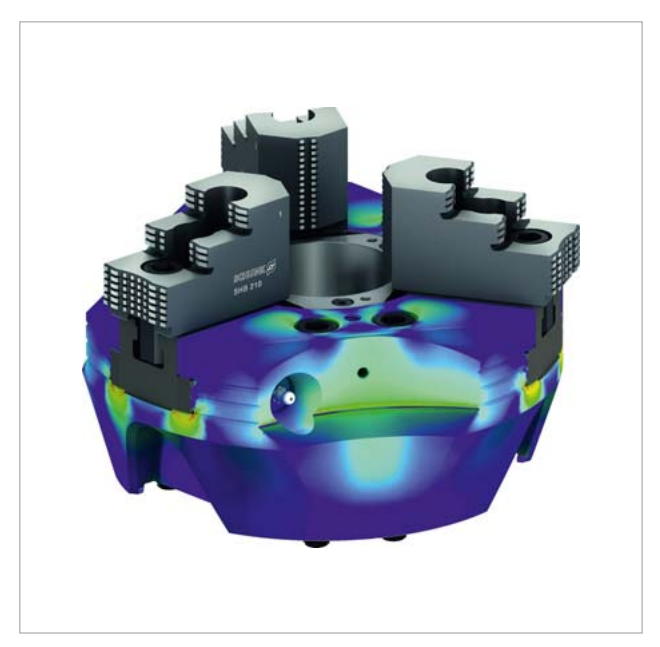
Fig. 4: FE parameter optimization for reduced notch stresses and highest stiffness % \left( {{{\rm{S}}_{{\rm{s}}}} \right)

Customer Story // Mechanical Engineering