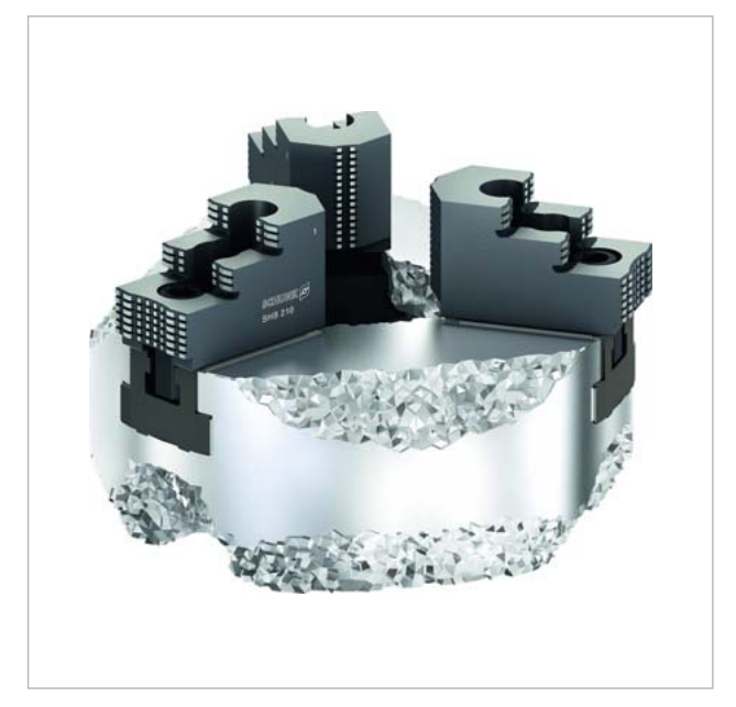
Fig. 3: FE topology optimization identifies the lightest chuck design from the force flow

Topology and parameter optimization made a lightweight chuck possible where the mass was reduced by 30 percent and the mass inertia by 40 percent. A 20 percent lower jaw centrifugal mass caused advantages such as shorter acceleration phases and a lower loss in clamping force under rotational speed. By optimizing the parameters in the jaw guidance area, the chuck stiffness was increased while the stress level was reduced at the same time. The result was