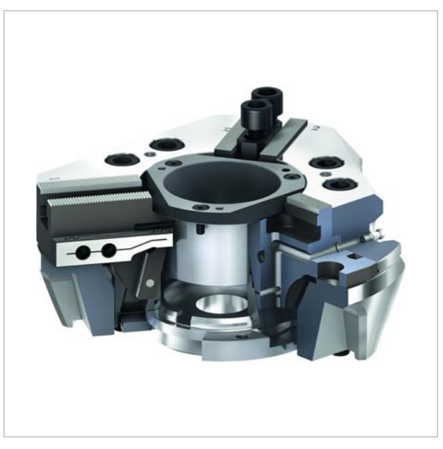
Fig. 6: The axially displaceable piston transmits the force to the base jaws and generates a radial jaw movement synchronous to the axis of rotation